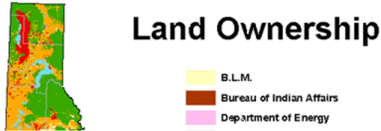
Figure 1. Idaho Land Ownership (http://forestpolicypub.com/idaho, 2017)

Ultimately this project relates to the production and availability of food (provided by meat animals including cattle and sheep), balancing this with achieving other socially valuable objectives including improving wildlife habitat and offering outdoor recreational opportunities.<sup>59</sup> In addition, it illustrates the value of partnerships with interested parties coming together to achieve shared goals. It is the strong hope of the partners that the objective, research-based data gathered at Rock Creek Ranch will inform policymakers and be useful in either avoiding litigation or helpful in lawsuits should they occur.