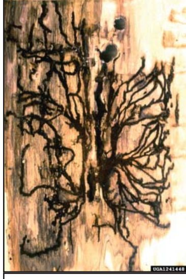
Spruce beetle gallery

Individual trees can be protected by using the antiaggregation pheromone methylcyclohexanone (MCH), which disrupts beetle aggregation.