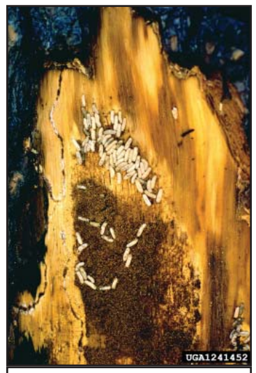
Red turpentine beetle gallery

Management: Thin overstocked forests, remove over-mature and stressed trees. Individual trees can be protected by using verbenone, which is an antiaggregation pheromone.