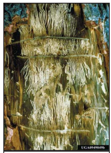
Fir engraver gallery

Management: Remove stressed trees and thin stands to maintain vigor, particularly during droughty years. Because pine engraver beetles that overwinter as adults normally infest green slash in the spring, avoid creating slash from December to June, unless it can be treated (masticated or burned) prior to early spring beetle emergence.