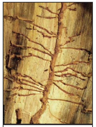
Mountain pine beetle gallery

Management: The most economical and efficient means of management is to maintain trees and stands in a healthy condition. Overall susceptibility can be reduced by decreasing stocking levels and increasing stand diversity. Regular monitoring and prompt removal of infested trees can reduce overall impacts, especially during droughty years.