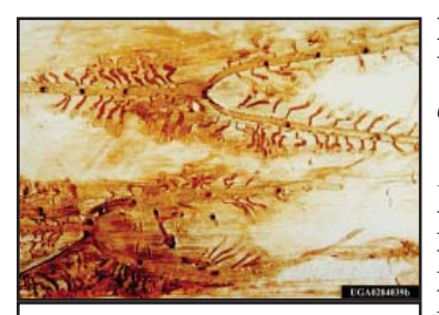
Pine engraver beetle gallery

Management: The most effective way to prevent red turpentine beetle attacks is to maintain tree vigor and avoid practices that damage trees during harvests. Fresh stumps, slow-dying and fire-scorched trees, exposed roots of live trees and trees with compacted soil around them should be removed from the site.