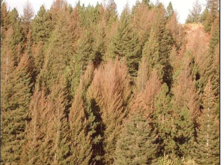
Western spruce budworm damage. Larval feeding causes foliage to turn red.

worm can be prolonged, and defoliation can be more severe during periods of drought. Bark beetle attacks may be higher during periods of drought. Drier forests of Idaho such as the Salmon-Challis, Payette, and Boise National Forests are currently experiencing WSB outbreaks and associated Douglas-fir beetle mortality. The Coeur d'Alene National Forest is currently experiencing widespread, light defoliation.