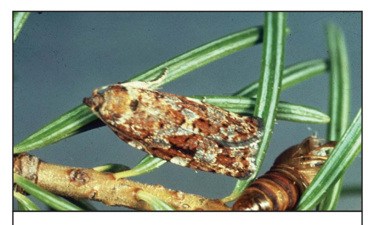
Western spruce budworm adult.

brown moths, but color can vary from tan to almost black. WSB go through four distinct life cycles - egg, larva, pupa, and adult. After mating, females lay eggs on the undersides of needles. Eggs are oval shaped, consist of masses of 25-40 eggs that overlap like shingles, and typically hatch in about 10 days. Young larvae do not feed, but move to crevices under bark scales or lichens where they spin silky shelters termed hiberniculae. They remain dormant in the silken shelters until the following spring. In later spring (April to May, depending on temperature) the larvae will exit the hiberniculae and migrate to the foliage, where they begin to mine the old foliage or feed on host flowers. After a week or two, they will enter developing buds, hence the activity or process that gives them their name. As new needles lengthen, the rapidly growing larvae continue to feed. They will web the foliage together and feed inside this web. It is at this point that most damage occurs. After approximately 40 days of feeding, the larvae pupate inside the webs, with adults emerging about one week afterwards and the cycle is complete. There is only one generation per year.