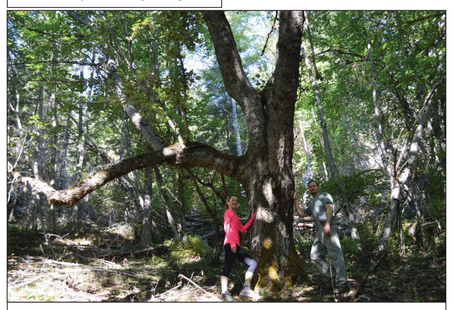
The new state champion red alder ( Alnus rubra ), shown with nominators Aaron and Amanda Black, is located on the Idaho Panhandle Forests in Bonner Co.

Fall is a great time to be outside camping with your family, hunting, or just enjoying a walk with your dog. And while you're outside enjoying the striking foliage and crisp temperatures, keep your eyes open for those big trees that are out there just waiting to be discovered, because now is a great time to bag yourself a trophy tree.