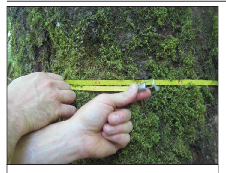
When nominating a big tree, measurements must be verified by a qualified forester.