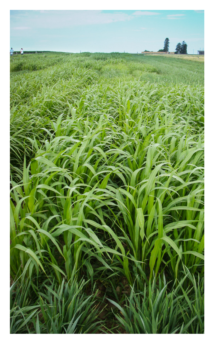
Figure 2. Sudangrass and sorghum-Sudangrass hybrids grow rapidly and produce high yields.

The sorghum-Sudangrass hybrids Special Effort, Enorma, HayKing, Forage King, Cadan, and Nutri-Plus have all performed well under Idaho growing conditions. Sudangrass and sorghum-Sudangrass hybrids work well planted alone or as the selected grass species in a mix of perennial legumes and/or brassicas. Sudangrass and sorghum-Sudangrass hybrids will winter-kill.