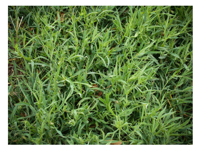
Figure 7. Chickling vetch performs best with a full season of growth.

Chickling vetch needs at least 60 days of growth for high nitrogen fixation and decent yields; therefore this legume is not suitable for a short growing window. Under a full season of growth, producers can expect good yields and excellent forage quality. For example, in a high-elevation full-season trial (118 days) in Idaho, chickling vetch yielded 5.5 tons per acre of dry