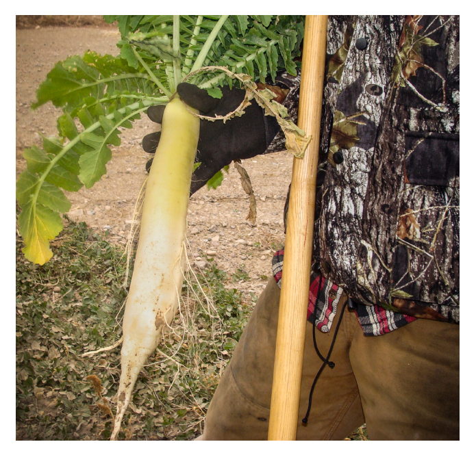
Figure 10. Oilseed radish works well as a cool-season cover crop. It can also be used to control nematodes.