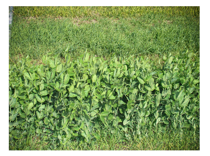
Figure 5. Rapid-growing arvika pea is known for its high yields and forage quality.

The steady performance of Austrian winter peas in Idaho makes it an excellent legume for a cover crop mix. In three cover crop trials in Idaho, Austrian winter