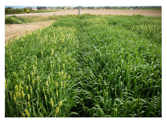
Figure 4. Willow Creek winter wheat (right) matures later than some cereal grains, making it a good crop to mix with a slow-maturing legume.

Producers should consult fertilizer guides for each species because insufficient nitrogen can decrease yields but excess nitrogen combined with low water availability can result in unsafe accumulated nitrate levels. Barley and wheat varieties can either be mixed in a fall planting, a spring planting, or a full-season cover crop mix. Cereal grains are recommended for use in a larger mix of legumes and/or brassicas because the grass helps provide structural support for the viney legumes.