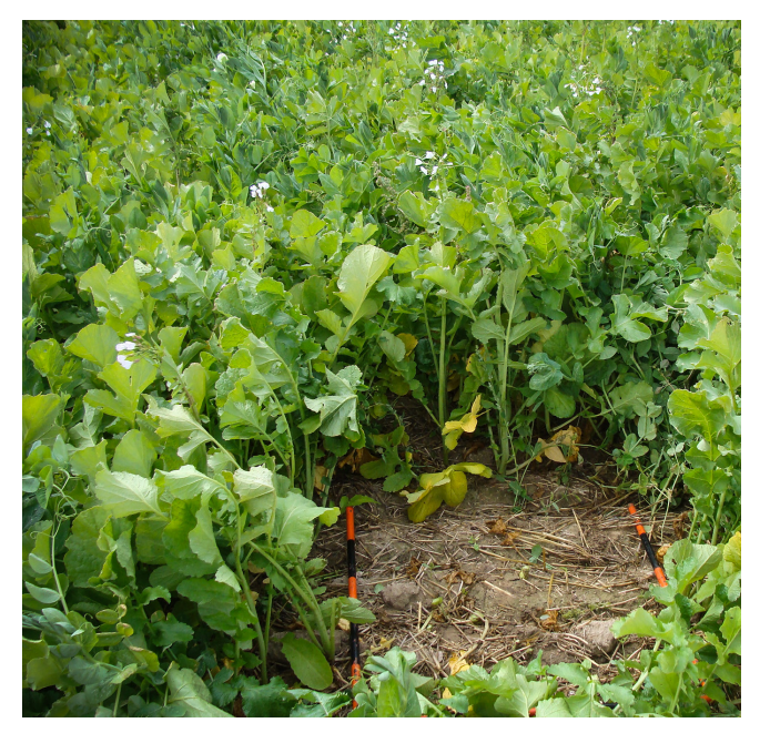
Figure 9. Canola is high yielding and highly palatable for livestock.

Idaho producers have used oilseed radish to control nematodes. Consult with a seed dealer to purchase oilseed radish varieties that exhibit more nematode control; some oilseed varieties can be a host or attract nematodes. Planting oilseed radish in a mix of more