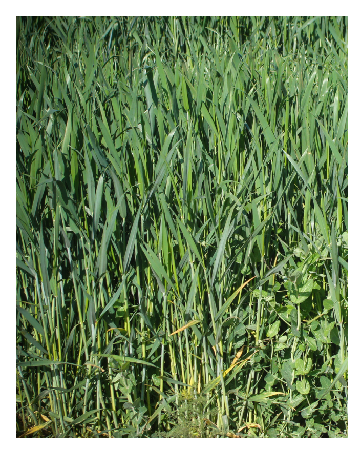
Figure 3. Triticale has the quality and yields of wheat and the hardiness of rye.

As a forage, triticale is high in energy, moderate in protein, and high in sugar, with good digestibility. Triticale's amino acid composition is similar to the protein in wheat but slightly higher in lysine. The lysine content in triticale is typically higher than corn. At the soft dough stage, triticale's available energy is similar to that of corn silage but with more effective dietary fiber. Producers should buy an awnless or semi-awnless variety for use as forage. Idaho producers commonly select triticale as the grass species in a larger cover crop mix because it improves yields and reduces seed costs. In a legume and triticale mix, the triticale will increase the yield while the legume will boost protein content.