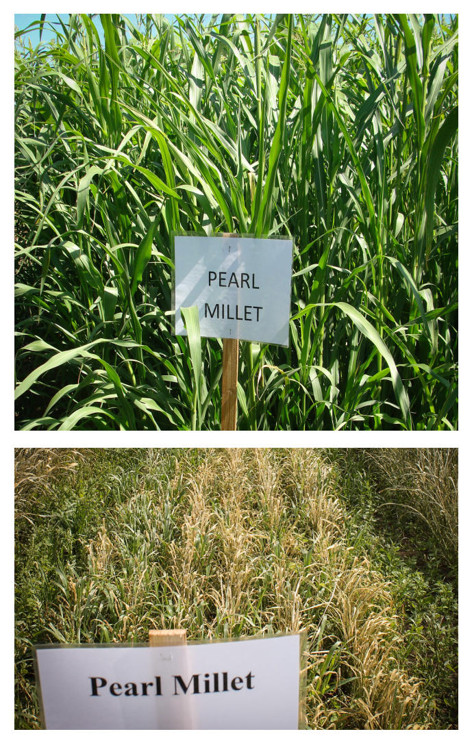
Figure 1. Top: Mid-June-planted pearl millet in August. Bottom: Mid-August-planted pearl millet in October with some frost kill, Kimberly, Idaho.

Pearl millet is a warm-season annual grass commonly grown as an emergency forage with a high nutrient value (figure 1). As a nutrient-rich grass, pearl millet is high in energy and protein and low in fiber and lignin concentrations. Pearl millet is most suitable for young cattle, lactating dairy cows, or calves under management intensive grazing that can utilize the feed efficiently. The feed is considered too costly to use for mature animals or those with low nutrient needs.