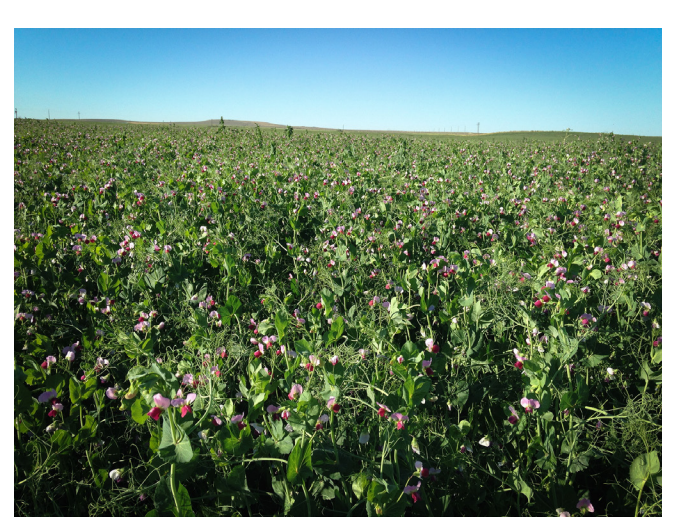
Figure 6. Austrian winter peas are winter-hardy and performed well in Idaho cover crop trials.