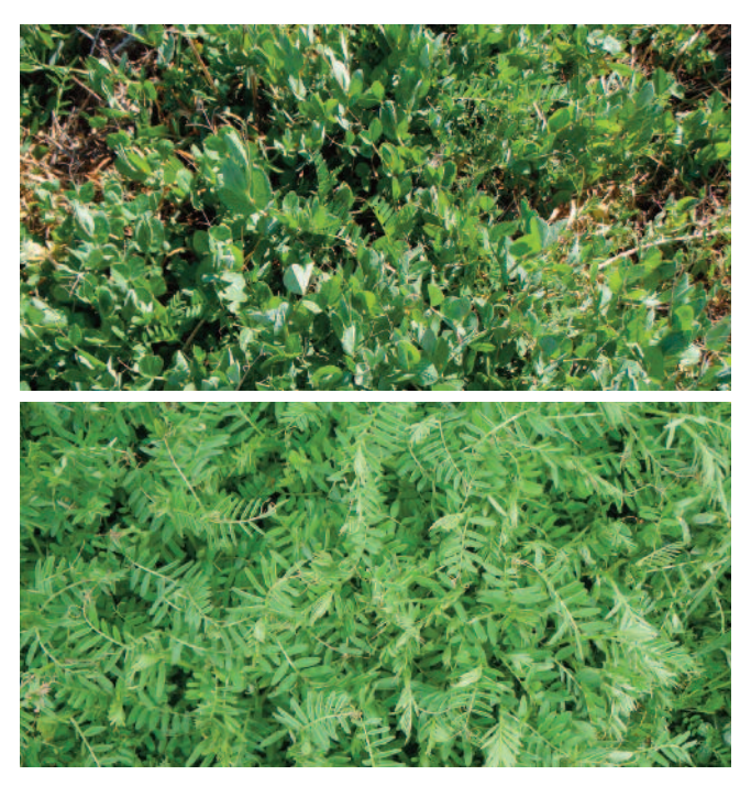
Figure 3. Austrian peas (top) and hairy vetch (bottom) are sometimes grown as winter cover crops in southern Idaho. Photos taken in mid-spring, Nampa, Idaho.