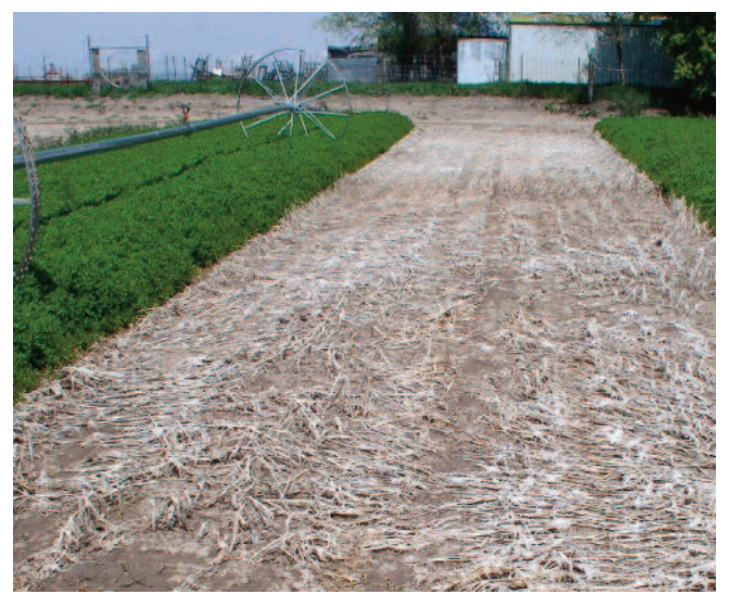
Figure 4 . Mustard residue left over in early spring from winterkill, Aberdeen, Idaho. Note the lack of weeds growing on this plot.