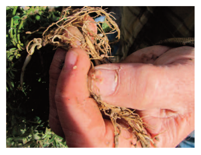
Figure 2 . Pink coloring in dissected legume root nodules of hairy vetch at Aberdeen, Idaho, indicates an active population of N-fixing rhizobia bacteria.

Many organic growers in the Magic Valley have had success maintaining at least 50% of their cropland area in alfalfa for a minimum of 3 years in order to build nitrogen reserves as well as improve soil structure and organic matter content. Growers who are transitioning a field from conventional to organic production are required to follow organic regulations for 3 years before the field can be