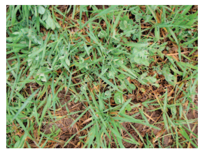
Figure 5. Austrian pea and winter wheat blend in early spring, Shoshone, Idaho.

When relying on cover crops as an N source, growers often search for simple tools to help them to predict how much N they can expect to be released from the plowed-under plant material. One useful tool currently available to growers is the OSU Organic Fertilizer and Cover Crop Calculator available at smallfarms.oregonstate.edu/calculator/. The calculator was created to allow Oregon growers to quickly and easily predict N availability from green manure crops based on tissue N content, total biomass, and dry matter content. While a similar cover crop calculator is currently being developed for Idaho conditions, the Oregon calculator may be used to provide a rough estimate of how much N will be released from a cover crop that has been plowed under. The Idaho cover crop calculator will be completed and available online starting in September 2013.