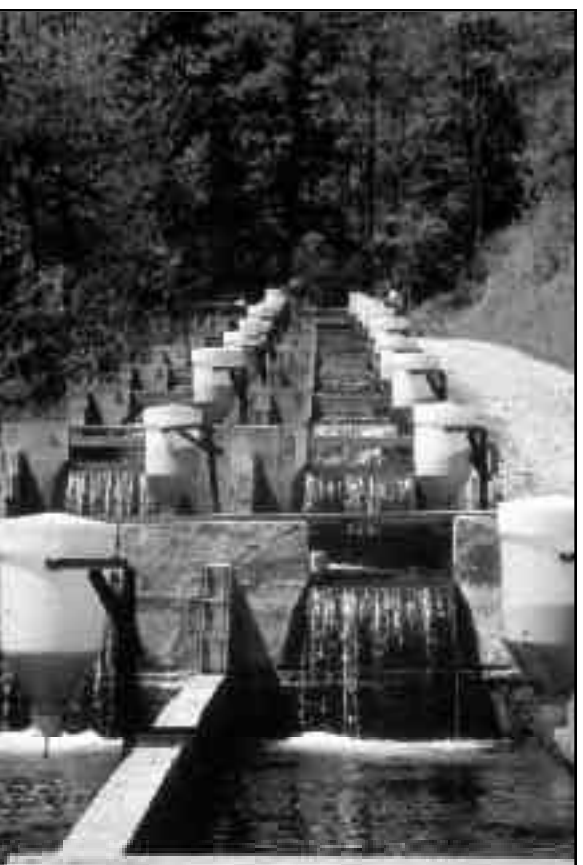
Figure 1. Serial water reuse in a Southern Appalachian trout farm.

accumulation of carbon dioxide from the fish. The farm's oxygenation and aeration systems should be able to remove carbon dioxide from the water.