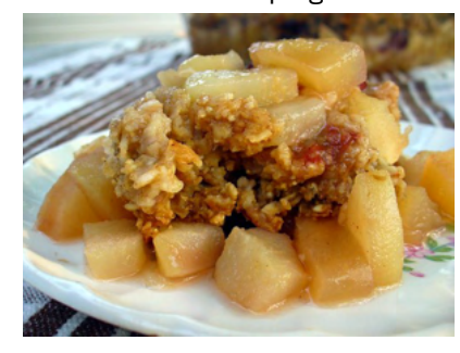
(Continued on page 4)

As we move forward in the next year, our goal is to continue this great momentum and foster high-quality outreach and extension programs in our