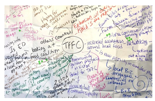
Graphic: A visual of the "positive ripple effects" identified by TFFC evaluation participants.

tive effects of a program through the process of storytelling and conversation. The motivation for using a REM evaluation was to articulate the positive ripple effects of the group's formation, partnerships, and projects. The REM was also the first formal evaluation of the coalition. Due to the fluid structure and unilateral leadership structure, the young group sought more, so the REM evaluation was also intended to reenergize and reengage group members and served as a segue for a more formalized strategic plan.