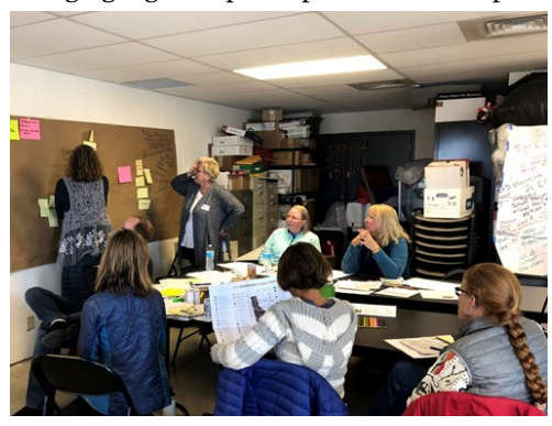
Photo: Teton Food and Farm Coalition participants begin the REM Evaluation Process, October 2018.

In October 2018, the coalition's core leadership and representatives from the main partnership organizations (UI Extension in Teton County, High Country Resource Conservation & Development Council, Slow Food in the Tetons, Teton County, City of Driggs, Teton Valley Farmers Market, and other local farmers) conducted a Ripple Effects Mapping (REM) evaluation of the group, followed immediately by a strategic planning session. REM evaluation is group process that requires bringing together participants to discuss posi-