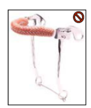
Mechanical hackamore OK for Gymkhana