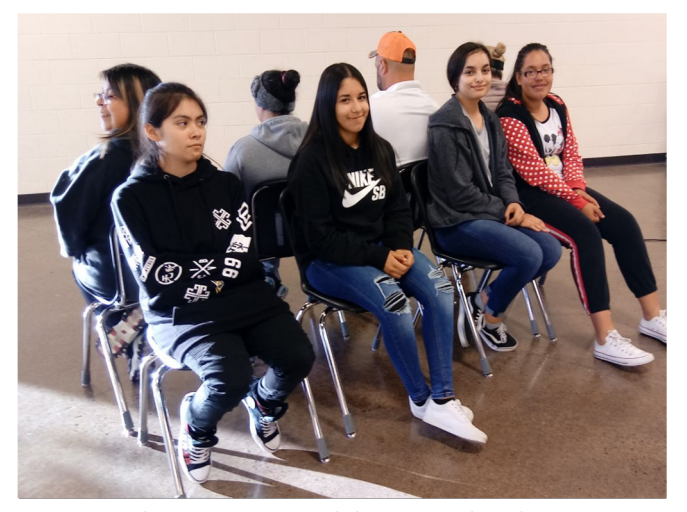
Juntos Family Engagement Workshop — youth and parents working together on family communication.

As a strategy to improve the academic success of Latinx students in Idaho and increase parent involvement, Juntos, a nationally supported 4-H program developed by North Carolina State Extension, has been implemented in Jerome County. Juntos (pronounced "Who-n-toes") means "Together" in Spanish. This program works to unite community partners to support Latinx eighth to 12th grade students and their parents with knowledge, skills and resources to support the youth in their journey to achieve a high school diploma and to encourage families to work together to achieve their youth's academic goals. Family Engage-