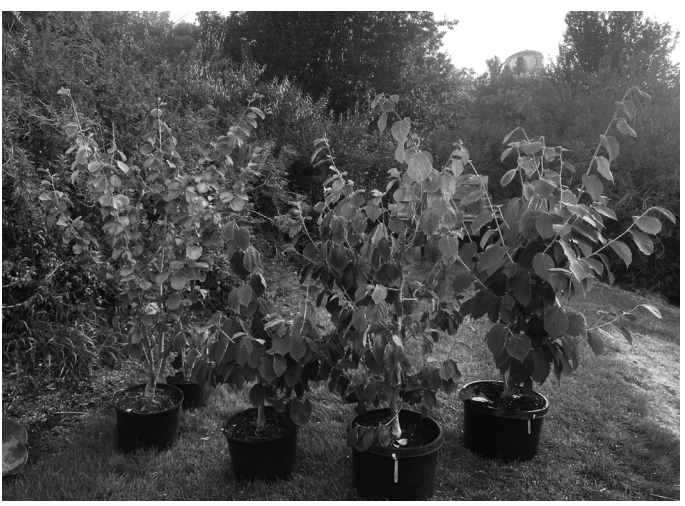
New Witch Hazels | 9/3/21

A new planting project has been expanding the collection of Asian Witch Hazels. Asian Witch Hazels are mid-sized flowering shrubs that are not widely planted, I think because they flower so early. They are essentially the first showy woody plant to flower in late winter, early spring, often showing color in late January here in Moscow. That means that they are all done flowering by March or April when most of us are thinking about what to plant. The colors range from clear yellow to fire engine red with lots of oranges and blends. Many of the cultivars are also noted