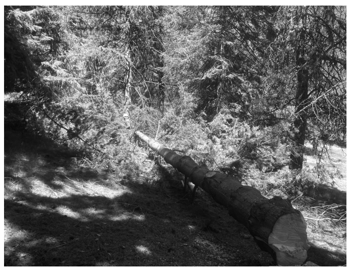
White Pine removal | 6/2/21