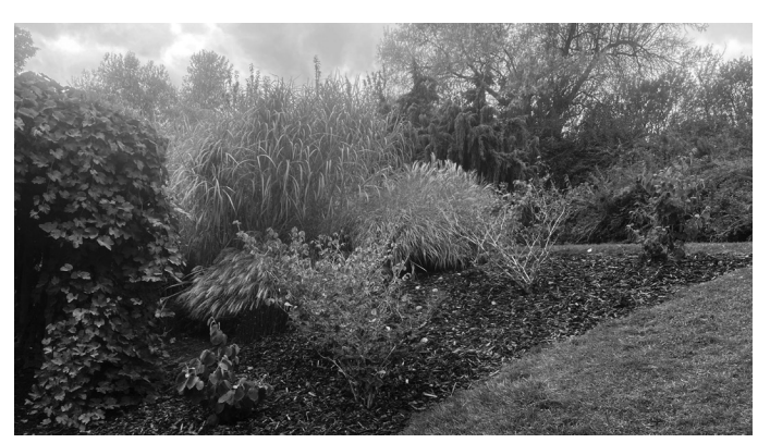
Asian Witch Hazel | 9/28/21