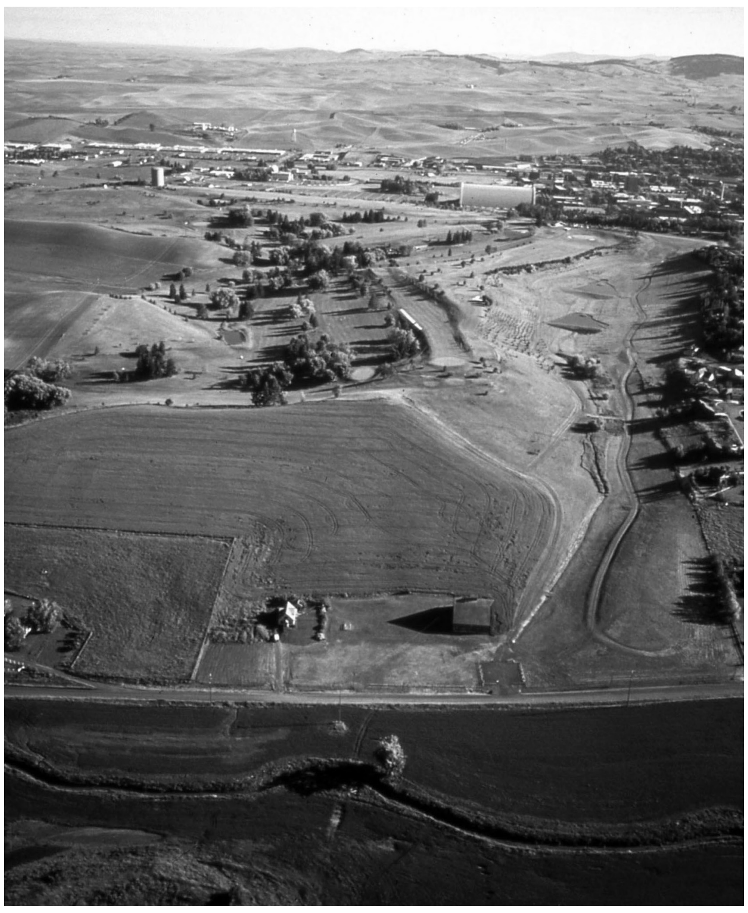
Ariel view of Arboretum | CA 1987-88