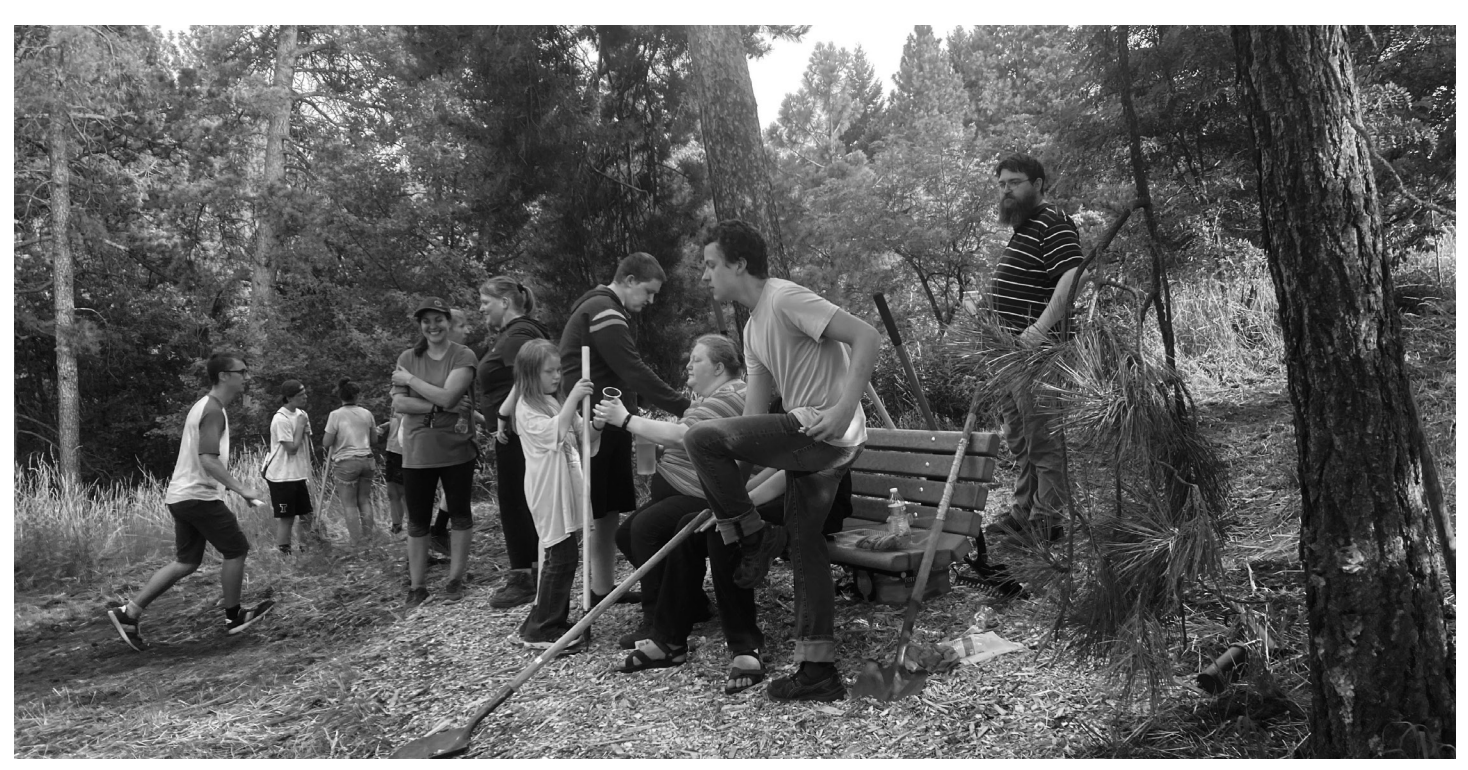
Youth group volunteers building trail Shattuck Arboritum | 7/1/21