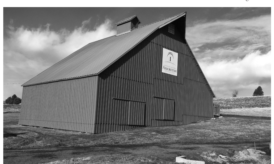
June 1928 Present Day