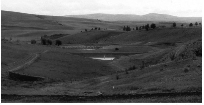
From Nez Perce Drive | CA 1987-88