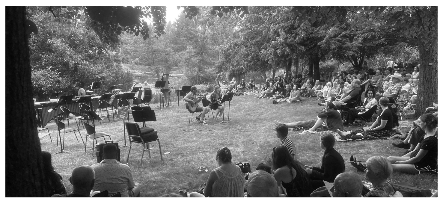
20th annual "Summer Breezes and Sweet Sounds Concert" | 7/12/21