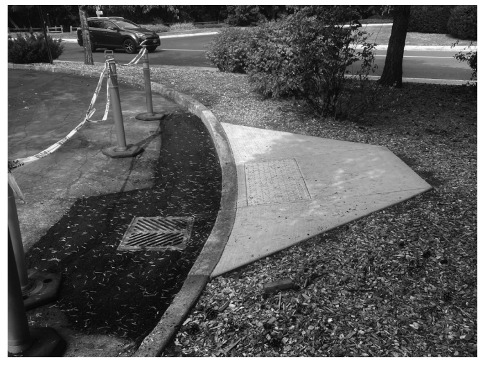
White Pine removal | 9/9/21