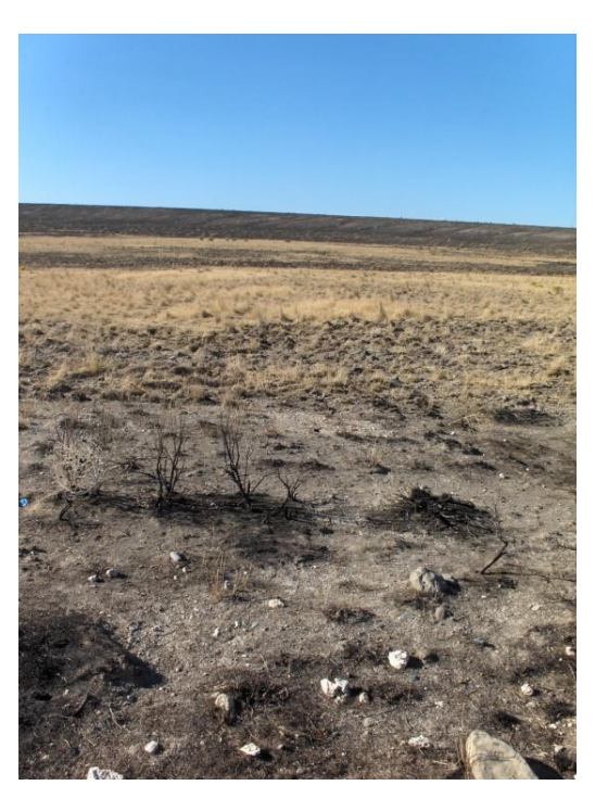
Figure 1. Sagebrush landscape post-fire.

ACCOMPLISHMENTS: In 2010, funding was secured to conduct a research project that examined if livestock grazing affects burn severity in sagebrush steppe. In North America, the range and quality of sagebrush habitat has been declining. Large, severe wildfires burning in hot, dry, and windy conditions, exacerbated by invasive species, are among the greatest contributing factors to this decline. Livestock grazing has been proposed as one management option to reduce fire hazard and decrease burn severity across sagebrush steppe. Remotely-